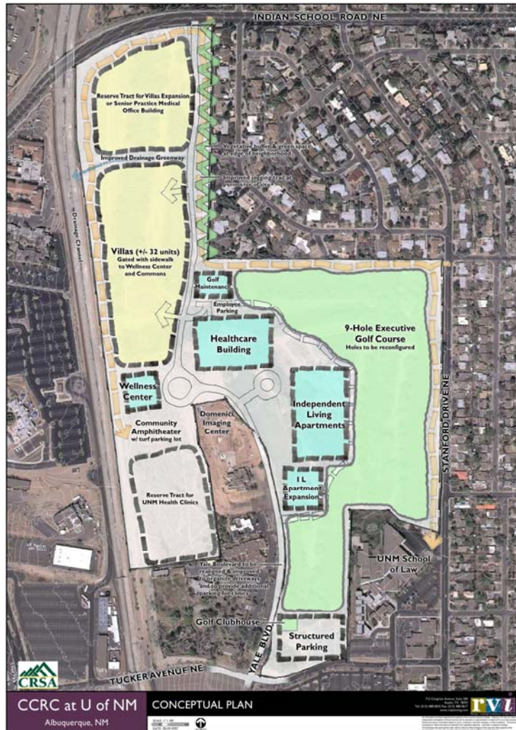
Sept. 28 th concept